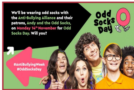
Odd Socks day—Monday 14th November